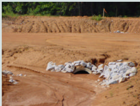
Erosion from unprotected construction sites harm our rivers, lakes and streams.

THE ANSWER — sediment caused by soil erosion.